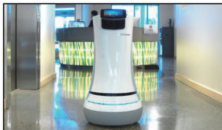
The "SaviOne" butler robot.